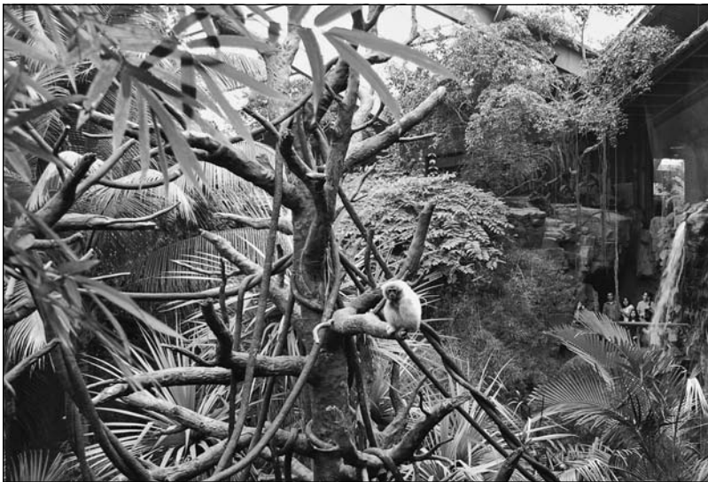
Visitors experience a rain forest in Omaha’s Henry Doorly Zoo’s Lied Jungle.